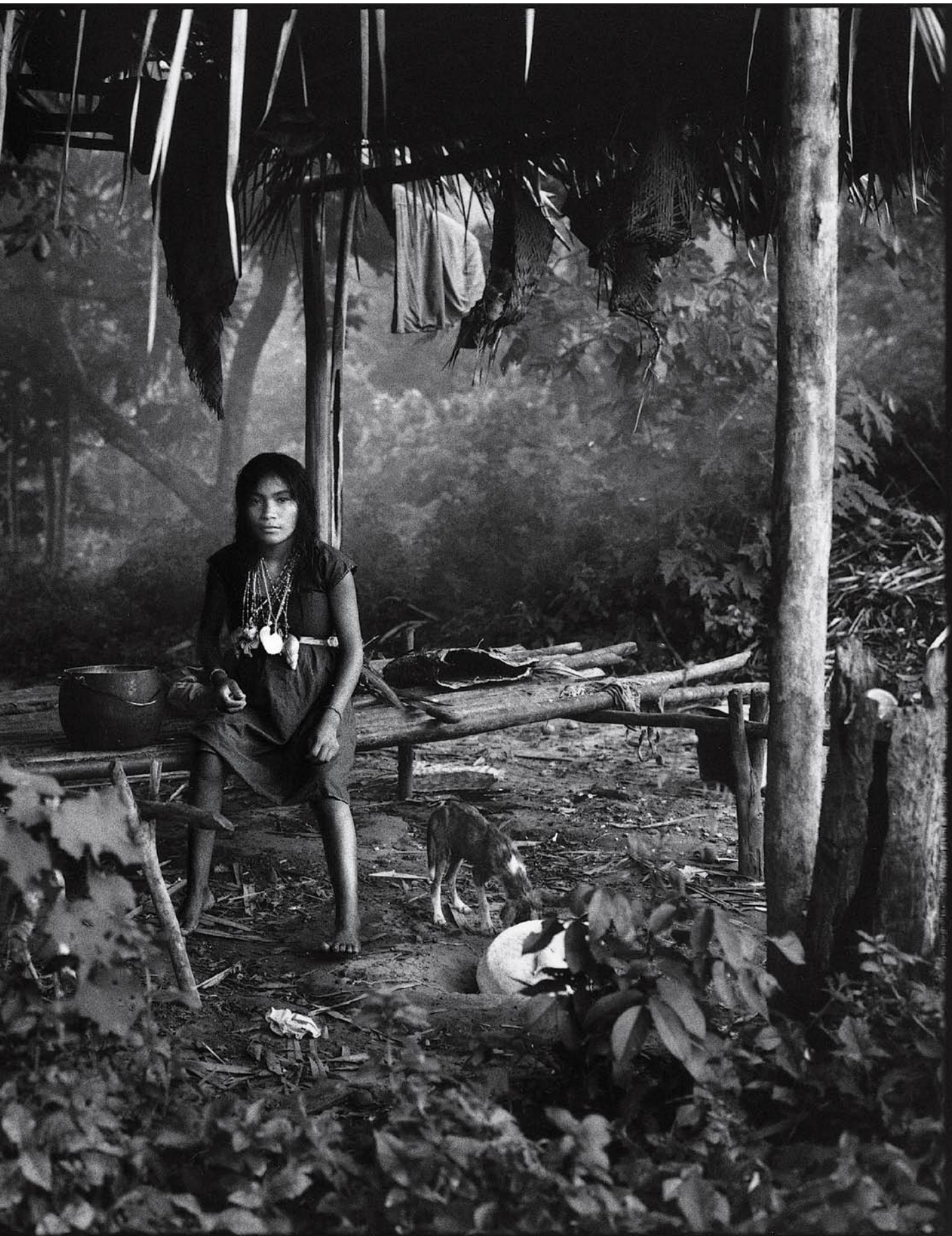
raised platform of thin branches to sleep on. The Pirahã keep very few possessions in their huts—pots and pans, a machete, a knife.