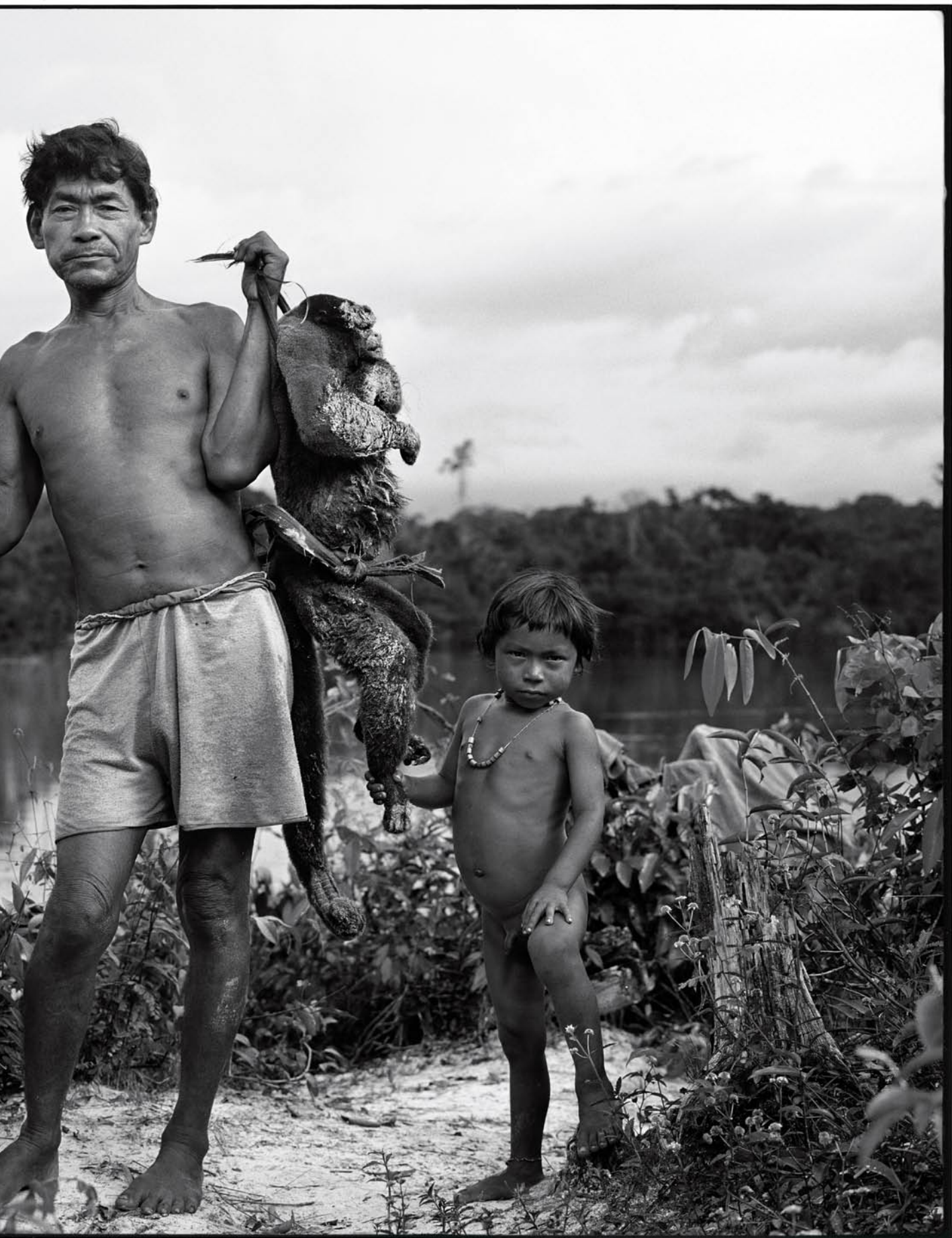
have resisted efforts by missionaries and government agencies to teach them farming, and subsist almost entirely on fish and game.